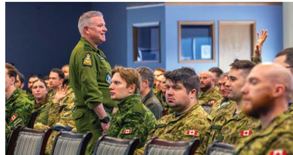
Director Flight Safety chief investigator Lieutenant-Colonel Scott Young says one of the easiest things to remember in flight safety is "if you see something, you say something." He met with 14 Wing Greenwood personnel during annual briefings April 13 and 14.

Well-known factors are often found in flight safety investigations: personnel fatigue, short-staffing, lack of supervision, haste, incorrect parts and equipment, not following procedure, inexperience, distraction, increasing paperwork, communication. Unintentional mistakes from any of those, singly or in combination, are