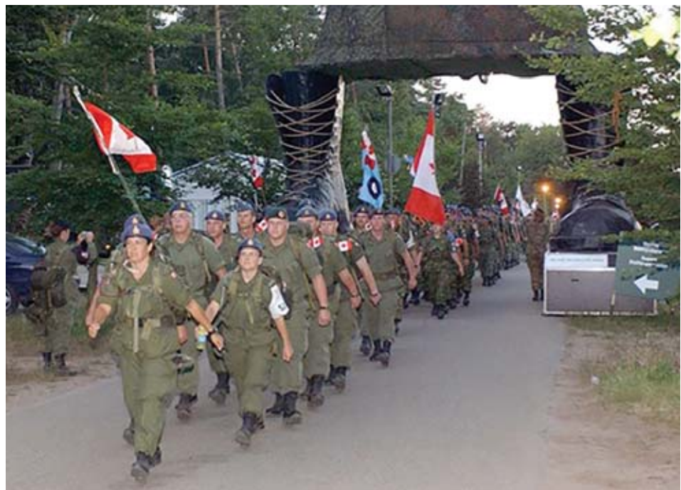
Canadian troops march in uniforms carrying Canadian and air force roundel flags at the Nijmegen March in 2015, with the shortest Canadian Armed Forces' member leading the group.