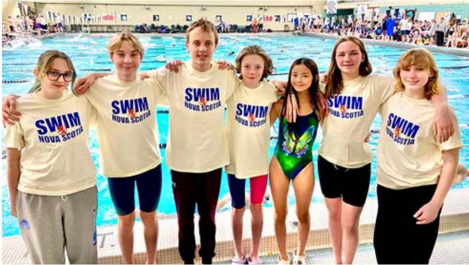
Seven Greenwood Dolphins Swim Club athletes travelled with a Swim N.S. Developmental Provincial Tour Team contingent to a Maine meet over March break; they returned with confidence, new friendships and swimming success. Submitted