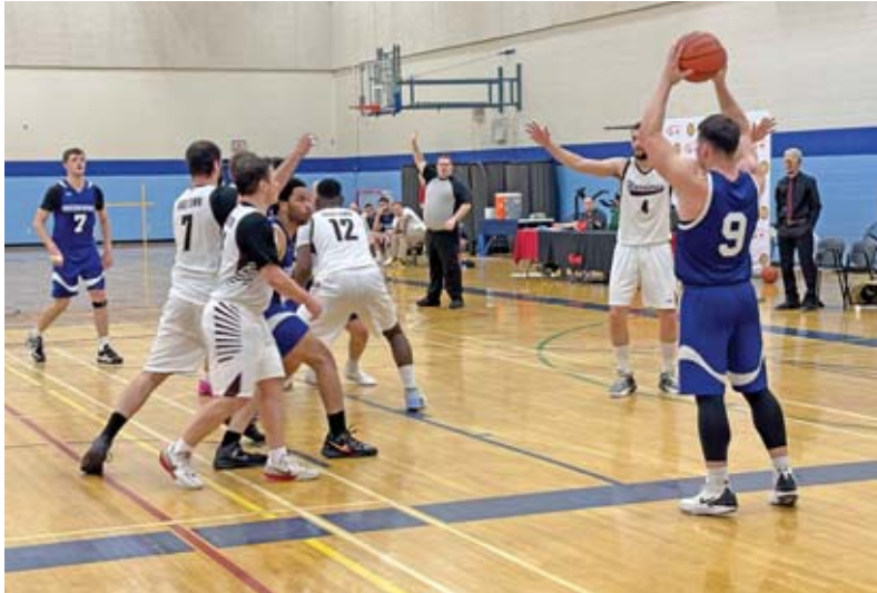
14 Wing Greenwood hosted the 2025 Atlantic region men's basketball championship March 17 to 21, looking to defend their 2024 Canadian Armed Forces national title. Perfect through the round robin, the 5th Canadian Division Support Base Gagetown Warriors defeated 14 Wing in the final.

The week started well for the Greenwood Bombers, with an opening night 86-44 win over