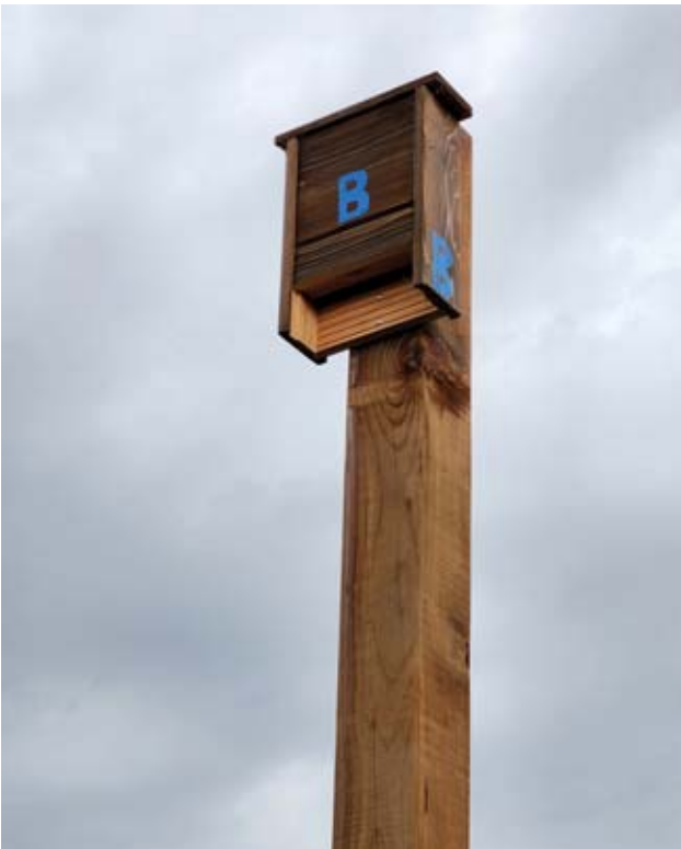
14 Wing Greenwood's Wing Environment has placed trial bat houses around the wing, hoping reported bats will make alternative homes, away from areas where they come into contact with wing personnel - and potentially impact operations. It is illegal to interfere with bats and their roosting sites, as three endangered Nova Scotia bat species are protected.

or in Greenwood's military housing area, contact Wing Environment to ensure the bat is handled in accordance with Nova Scotia's wildlife laws. For those outside the base, the Department of Natural Resources and Renewables can also assist with bat-related issues. Setting up bat houses on private property is also a proactive measure to deter bats from roosting near homes or workplaces. Bat houses may be purchased or built, and wildlife protection agencies offer guidance on proper setup. Call 1-866-727-3447, or visit batconservation.ca or novascotia.ca/natr/wildlife/sustainable/living-with-wildlife/bats.asp for more resources. ➔