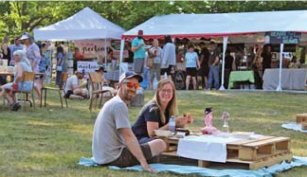
Visit the first Kingston Farmers Market of the 2024 season and get to know some of the local producers in your community, talk to them and see what they are about. June 6, there will be over 50 vendors, live music, a fun photo booth, a kids' area with a free craft, food trucks, a community puzzle and other experiences. Submitted