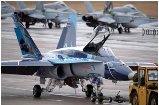
May 3 was the official reveal for the 2024 RCAF100-themed CF18 Demonstration Team paint scheme, at 4 Wing Cold Lake.