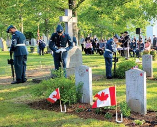
14 Wing Greenwood are active partners and now lead the service, traditionally held the second Sunday in June. This year marks 81 years since the inaugural ceremony. ➔

In 1943, members of I.O.D.E. Rosemary Chapter Middleton took on the honour of tending the graves, and remembering the service members with the annual decoration of the graves service. To 2022, chapter members planted hostas, flowers and maintained the graves. The Middleton Legion and