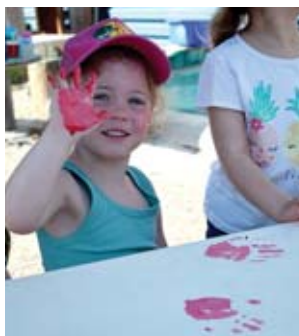
May 23, children at the Greenwood Military Family Resource Centre added coloured hand prints to a banner, destined to hang in the Defence Indigenous Advisory Group's teepee as it is on display.