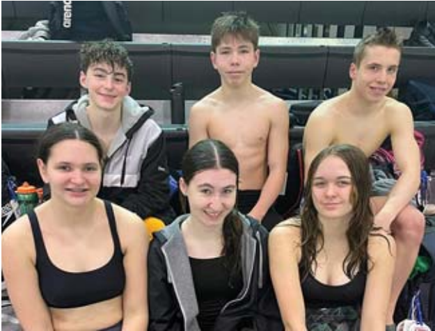
Six Greenwood Dolphins members competed at the AAA level of the recent David Fry East Coast Championships, swimming to 29 personal bests between them – and two medals.