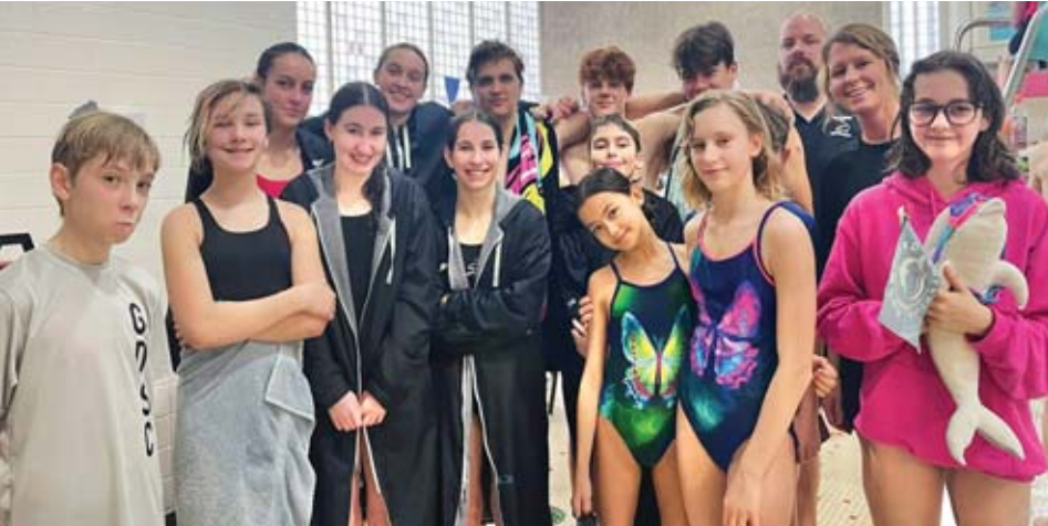
The Greenwood Dolhpins sent 14 athletes to the Winter Champs meet – bringing home a 17-medal haul and multiple personal best swims. Submitted