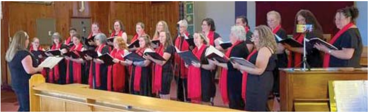
The Canadian Military Wives Choir Greenwood's Spring concert June 17 was an entertaining afternoon of varied selections.

Very smartly attired in black, with bright red scarves, the ladies of the choir were a well-balanced team covering a good vocal range - a great delight to listen to and enjoy. The singers were obviously enjoying their performances as much as we, the audience, were. As well as their musical