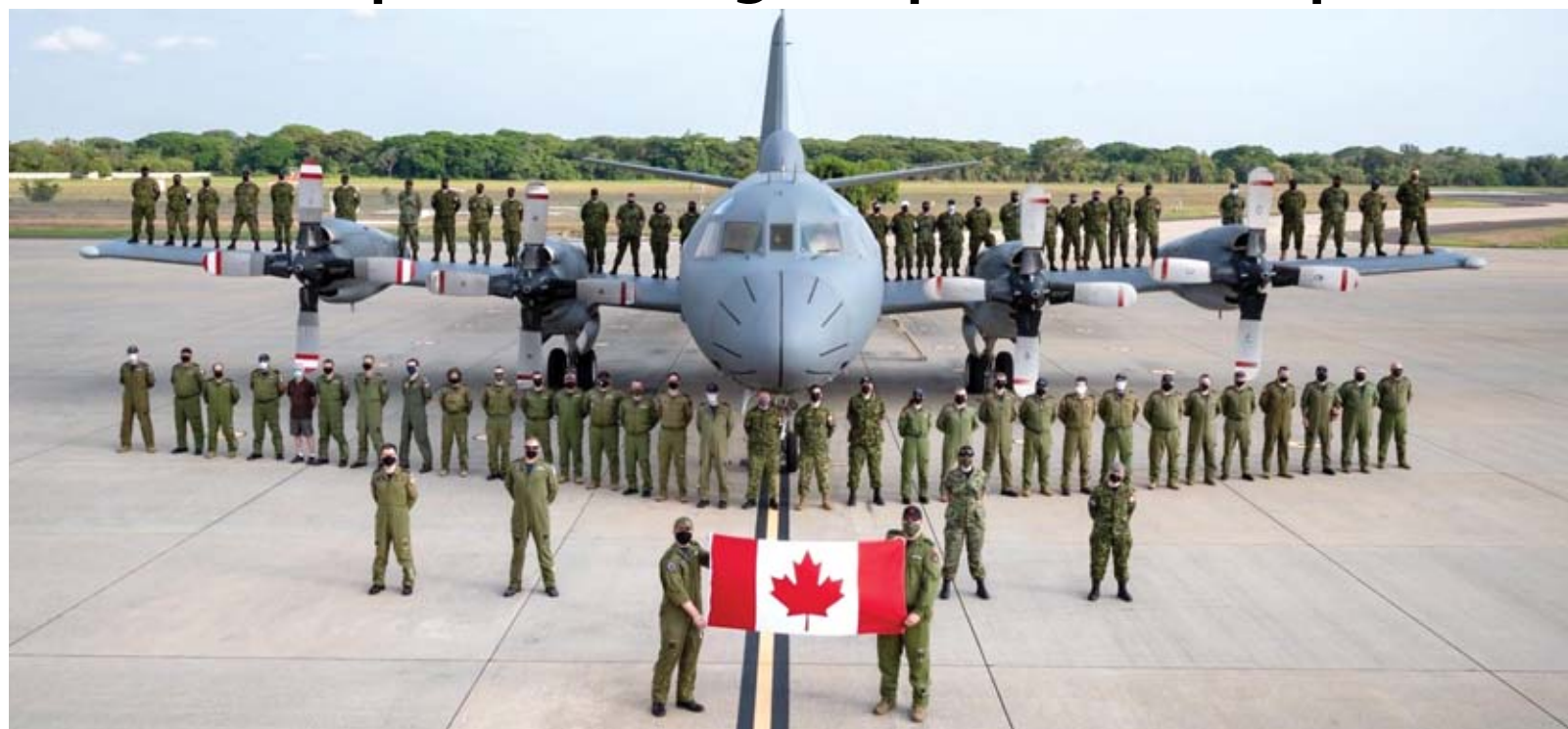
The full Op Caribe detachment, comprised primarily of aircrew and ground technicians from 415 (Long Range Patrol Force Development) Squadron, was augmented by aircrew and ground crew from 405 (Long Range Patrol) Squadron, testing personnel from 434 (Operational Test and Evaluation) Squadron and 14 Operational Support Squadron personnel as the mission support element.

Op Caribe is Canada's participation in U.S.-led counter-narcotics operations, since 2006, in the Caribbean Sea and the Eastern Pacific Ocean. This operation involves periodic deployments, meaning ships and aircraft participate in it at different times during the year. The number of CAF members deployed on Op Caribe has varied over time, depending on the number and size of ships and aircraft. Over the past 15 years, the CAF has contributed to the disruption or seizure of more than 112