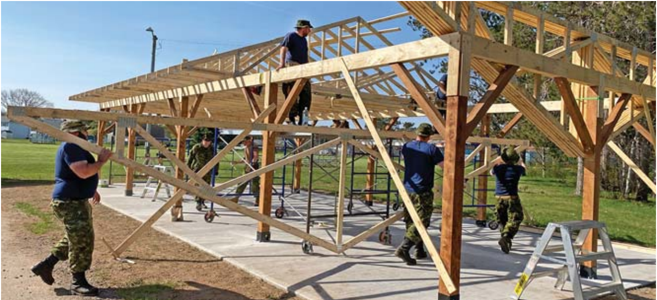
Construction Engineering team members work together to install the roof trusses for the new Apple Bowl picnic shelter.