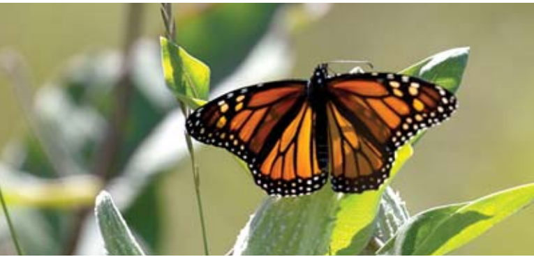
Monarch butterfly, resting on a seedpod of the Common Milkweed plant before embarking to overwintering grounds in Mexico.