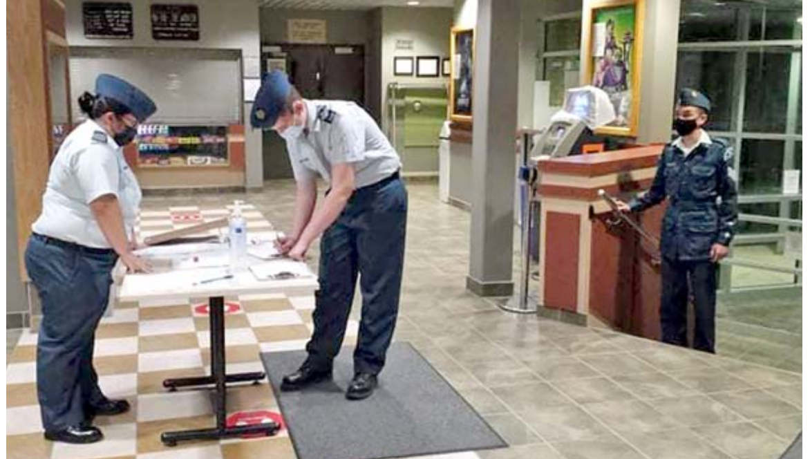
517 F/Lt Graham Royal Canadian Air Cadets meets at 14 Wing Greenwood, and welcomes returning and new youth ages 12 to 18 as fall programs get underway.