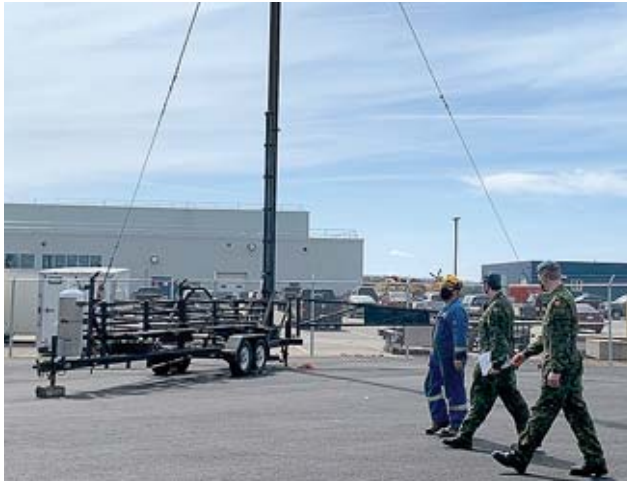
14 Fire and Emergency Services firefighters visit the new compressed natural gas daughter station April 9, checking on preparations for Irving’s flare testing.

The April 9 conversion means the first of three boilers in the heating plant will run on the cleaner fuel for the remainder of this heating season.