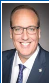
Chris d'Entremont Member of Parliament for West Nova/Député - Nova-Ouest

We are now open to the public Tuesdays and Thursdays 9 a.m. - 3 p.m.