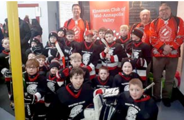
On the Mid-Valley Kinsmen’s 2020 Day of Kindness, members provided hot chocolate to all participants after games at a minor hockey tournament in Middleton.

“Radio Days,” as members canvassed local businesses for ads, took over CKAD in Middleton for an hour each night for a week to act as DJs, while reading the ads and playing music. This project continued for almost a decade and was