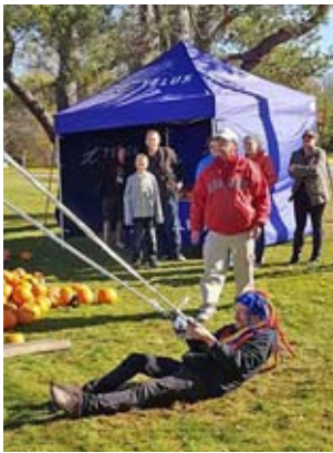
The Mid-Valley Kinsmen have been some of the “people power” behind the Kingston Squash CF event raising funds and awareness for Cystic Fibrosis research.

viewers, has raised many tens of thousands of dollars over the last 40 years. The Kinsmen Hall, during this time, has undergone expansion and upgrades, with another room added and a finished basement providing a better facility for all the local groups that call it home. The Mid-Annapolis Valley Kinsmen Club has continued raising money for Cystic Fibrosis and Multiple Sclerosis research, minor sports, local ice arenas and local welfare. For many decades, it has awarded bursaries to deserving graduates at Middleton, West Kings and Central Kings high schools. Members have contributed to the purchase of much needed new equipment at Valley Regional Hospital, supported Middleton’s Soldier’s Memorial Hospital, the