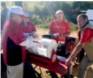
Kinsmen conduct a 50/50 draw at a 2019 Valley Stock Car track event.

The Mid-Valley Kinsmen received its charter and began operations as a local service club April 7, 1971, first formed under the name the “Kinsmen Club of Kingston-Greenwood.” For its first two years of existence, it met in local restaurants while raising money through apple picking, candy sales and raffles. It was able to support such projects as the creation of the Beehive in Aylesford, minor sports, maintaining the picnic area at Trout Lake, local welfare and Cystic Fibrosis research (over the years, the Kinsmen Clubs of Canada have raised over $47 million towards finding a cure for Cystic Fibrosis).