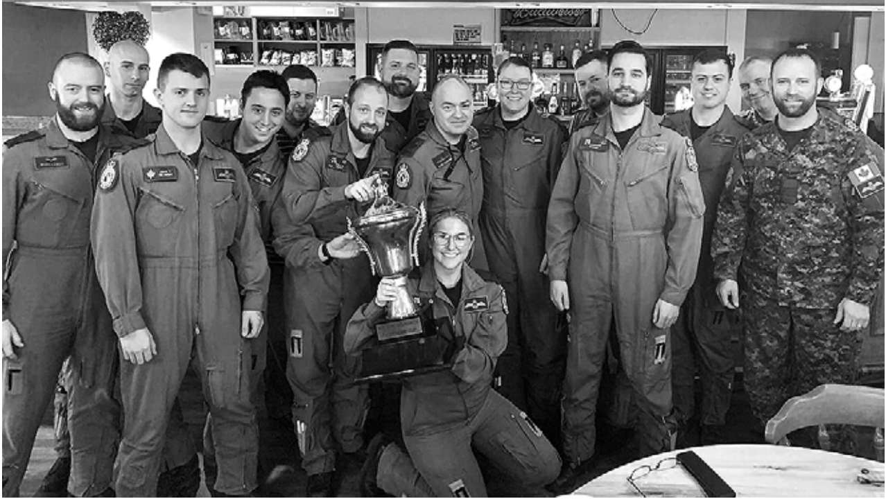
405 (Long Range Patrol) Squadron's Crew 3 Vultures won the February Pathfinder Cup squadron-wide, anti-submarine warfare training challenge.

Anti-submarine warfare (ASW) is a multi-faceted skill that requires individual crewmembers to work together smoothly so the mission comes to a successful conclusion. The winner of the Pathfinder Cup would be the crew that successfully attacked all submarines faster and more accurately