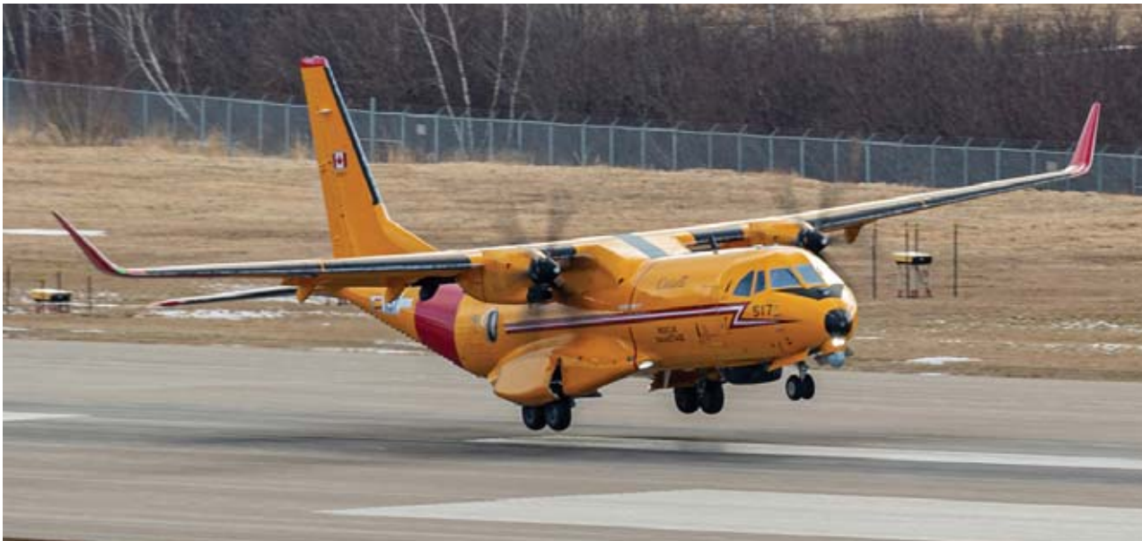
New Fix Wing Search and Rescue CC295517 landing at 14 Wing Greenwood January 30.

The first aircraft to be used in operations is scheduled to arrive at 19 Wing Comox in mid-2020. Initial operational capability is anticipated in