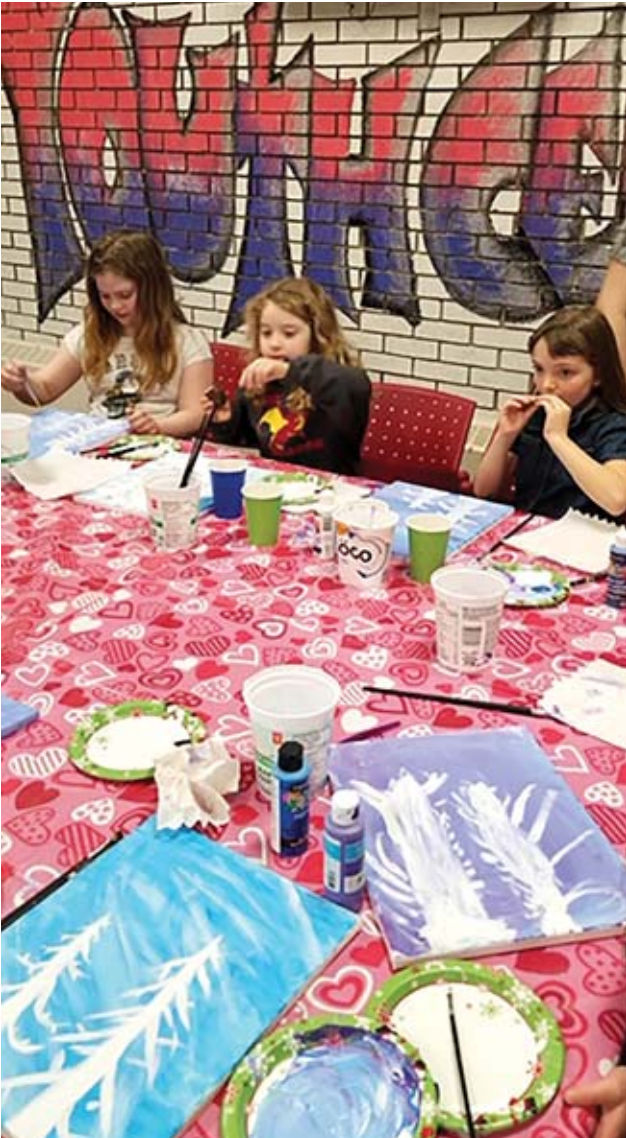
Girls attending the 14 Wing Greenwood Community Centre’s weekly Girls Club put paint to canvas recently, working on a winter scene during a paint night activity.

Support the advertisers that stand behind your military