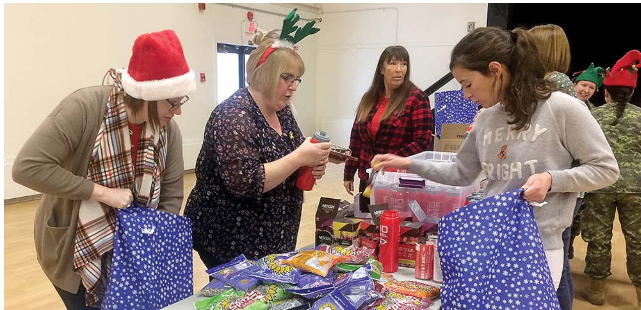
Volunteers turned out to pack maple syrup, chocolates, toiletries, socks, water bottles and all kinds of other goodies from "home" into festive stockings and Christmas bags, destined to be sent to dozens of deployed military members in time for the holidays.

The GMFRC will be sending several dozen parcels to deployed members from units in Western Nova Scotia,