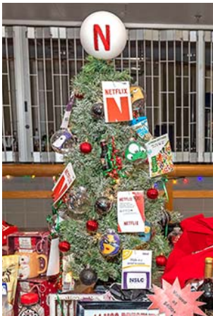
14 Wing Imaging

14 Wing donated $1 per pay for a calendar year, it would raise the annual goal on its own. Participants may select any one time or per-pay contribution and have it recorded