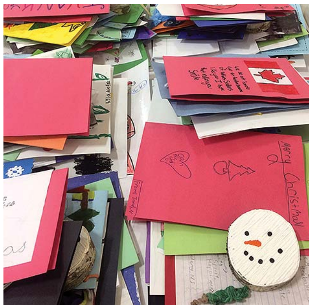
Handmade cards and crafts from schools and youth groups throughout Western Nova Scotia are the last special wishes placed in the Christmas hampers.

including 14 Wing Greenwood, that come under its program reach. There are