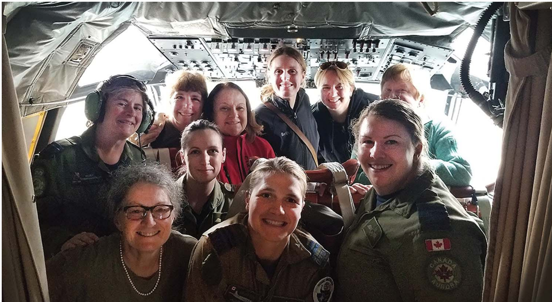
Aviators with The Ninety-Nines, pictured with CP140 Aurora female aircrew from 14 Wing Greenwood, after their familiarization flight.