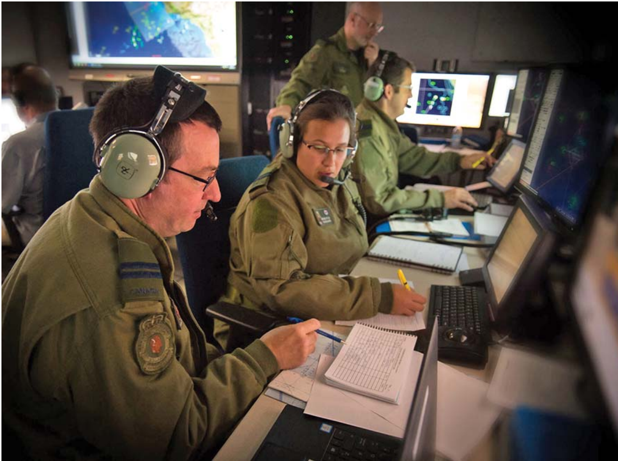
Members of 14 Wing Greenwood CP140 Aurora crews participate in their portion of the international Coalition VIRTUAL FLAG 19-4 training exercise, from the Thorney Island Simulator Training Area, 14 Wing Greenwood, September 13.

Planning for the complex, joint warfare simulation started almost a year ago, with 404 Squadron's modeling and simulation (M&S) experts working closely with the Royal Canadian Navy's (RCN) Distributed Mission