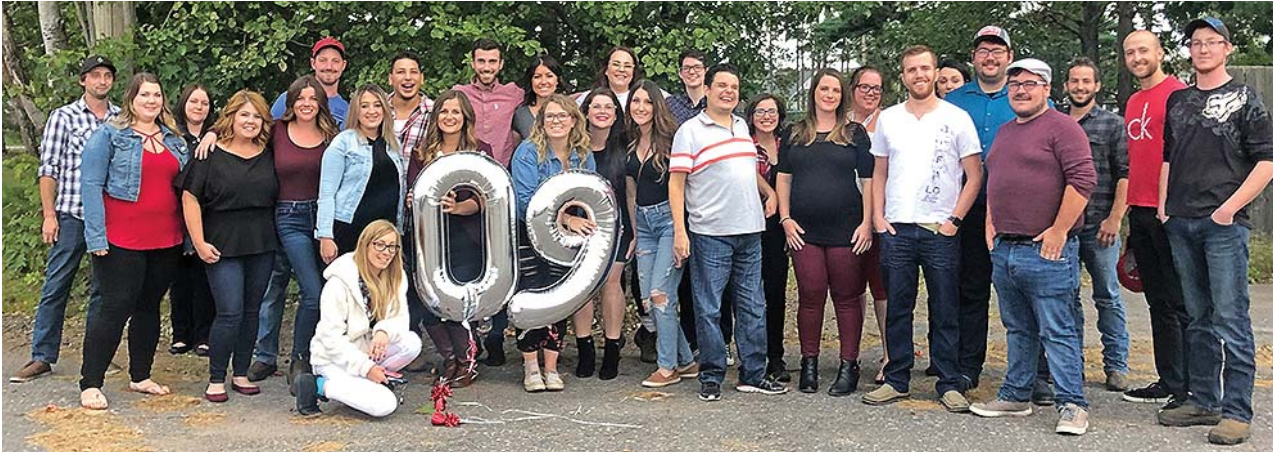
A decade has passed since these once fresh-faced West Kings District High School grads last met as a large group.