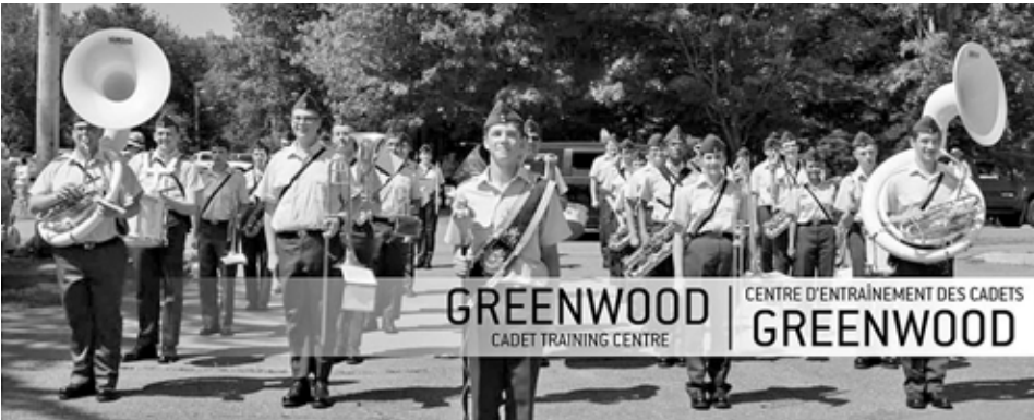
Over 900 Cadets and staff instructors are starting summer programs at the Greenwood Cadet Training Centre this week, the 68 th year of Cadet camps on the grounds of CFB Greenwood.

"So keep an eye out this summer for Cadets around the community and say 'Hi' when you see us in town or