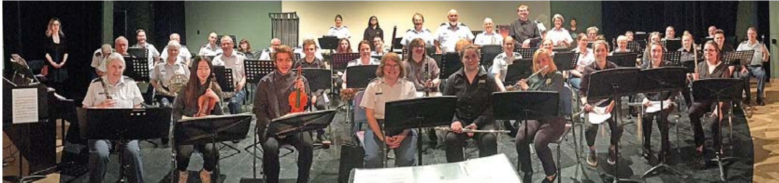
Members of the 14 Wing Brass and Reed Band combined with both the Junior and Senior Bands of Digby Regional High School for a June 5 concert event.