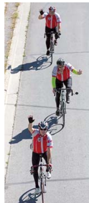
The Wounded Warrior Canada Highway of Heroes Bike Ride is coming to Nova Scotia for the first time. Organizers are planning for up to 100 cyclists to take in the two-day event August 24 and 25.