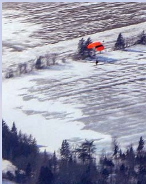
CASARA volunteers helped 413 (Transport and Rescue) Squadron from Greenwood February 20 with a Hercules intercept exercise. Three SAR-Techs parachuted down to the simulated crash site to help rescue the survivors.