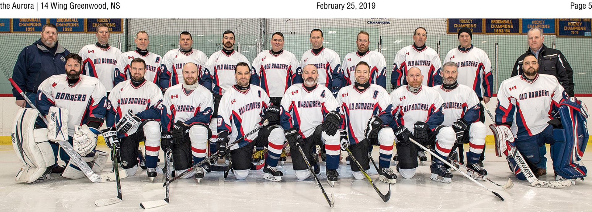
The 14 Wing Greenwood Bombers during the opening ceremonies of the 2019 Atlantic Regional Old-Timers Hockey Tournament at 14 Wing Greenwood February 12. Corporal T. Matheson, 14 Wing Imaging

Les modes alternatifs de résolution des conflits (MARC) ne se produisent pas uniquement au sein du bureau du service de gestion des conflits et des plaintes (SGCP). Tous puissent participer au MARC par le biais de conversations individuelles. Cette approche est précoce, locale et informelle (PLI) aide à écraser les conflits dans l'œuf. Si vous choisissez de régler cette situation directement avec votre collègue, voici une approche en trois étapes pour aborder le problème et définir un moment pour la conversation. Étape 1 Énoncez la situation telle que vous la voyez, en vous concentrant sur le problème (pas sur la personne), en utilisant un ton et des mots neutres et non accusateurs. Exemple: j'ai remarqué que nous avions du mal à communiquer lors de réunions et qu'il n'était pas toujours possible de finir de partager nos pensées. Étape 2. Expliquez pourquoi il est important pour vous d'avoir cette discussion. Exemple: il est important que nous en parlions afin de pouvoir nous exprimer pleinement lors de réunions, ce qui peut renforcer l'équipe. Étape 3. Recherchez un accord sur les problèmes et invitez l'autre personne à collaborer avec vous pour les résoudre. Exemple: Etes-vous d'accord pour dire qu'il ya un avantage à en parler? Nous pouvons prendre du temps cet après-midi si vous êtes disponible. Pour plus d'informations, contactez votre bureau SGCP local: Centre de Services de Gestion des Conflits et des Plaintes 14 Escadre Greenwood, 902-765-1494 poste 3083.