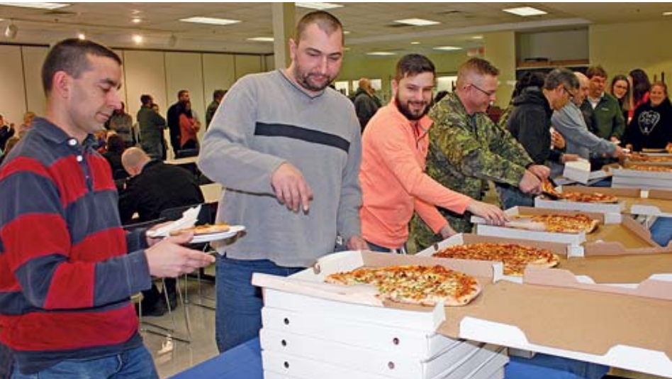
Logisticians working in all trades at 14 Wing Greenwood had a celebratory pizza lunch February 1, the 51st birthday of the Royal Canadian Logistics Service.