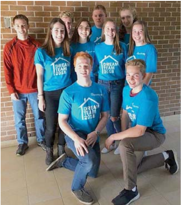
Ten West Kings students have been working throughout the year to raise funds for their service trip to the Dominican Republic in March, where they will build a home for a family in need.