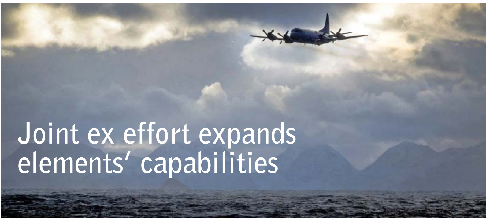
A 404 (Long Range Patrol and Training) Squadron CP140 Aurora aircraft flies near Andøya, Norway, during Exercise Neptune Trident October 30.