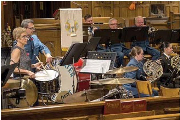
Members of the Bridgewater Fire Department Band percussion section perform.