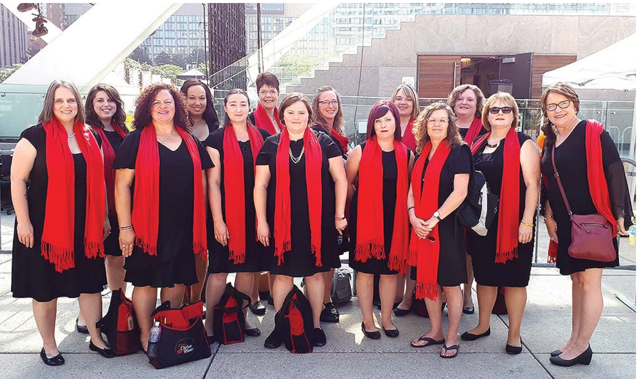
Members of the Greenwood Canadian Military Wives Choir in Nathan Philips Square September 23, the day of their joint Invictus Games opening ceremony performance.

The short time away kept them busy with many social events and practices, along with the highlight performance, and the Greenwood choir returned home September 24. The Invictus Games has also come to an end but, for the growing choir, its potential to sing to new levels has been set even higher.