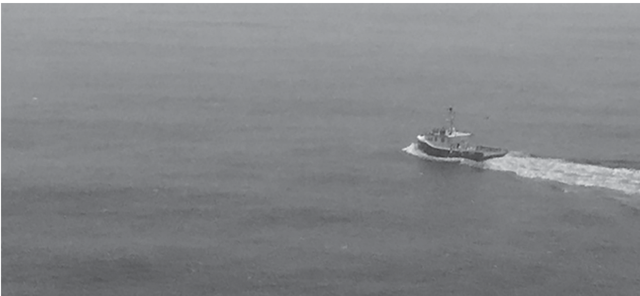
413 (Transport and Rescue) Squadron crews airlifted a fisherman February 11 from a boat off Lockport, transporting him to hospital care in Yarmouth.

February 11, just after 9:30 a.m., 413 (Transport and Rescue) Squadron launched a CH149 to extract a male with broken leg on shore near the Chebucto Head light house. En route, the helicopter was re-tasked to extract a male from a fishing vessel off the Lockport area. That man was successfully extracted, and transferred to an ambulance at the Yarmouth hospital helicopter pad in stable condition. The helicopter returned to 14 Wing Greenwood just after 1 p.m. February 12, around 9:30 p.m., one of 413 Squadron's Hercules aircraft was tasked to provide top cover for a 103 Squadron medevac of a male off a fishing vessel 175 nautical miles east-north-east of St. John's. The mission was completed just before 4 a.m. Also February 12, just after 4:30 a.m., a 413 Squadron Cormorant was tasked to medevac a 24-year-old man with a crushed left hand from a fishing vessel, located approximately 100 nautical miles south of Port Hawkesbury. A Hercules was tasked at 5:10 a.m. to provide top cover.