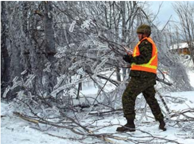
Members of 4th Artillery Regiment (General Support) remove fallen tree branches and damaged trees during Operation Lentus in the Acadian Peninsula January 31.