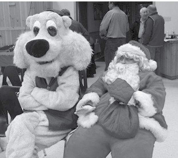
Santa and Roary take a break.