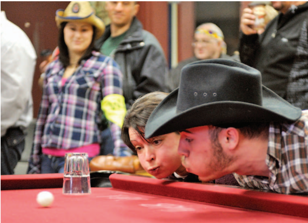
Part of 14 Wing's Winter Carnival festivities included a very non-competitive game of blow ball.

In the overall ranking, Wing Administration branch members scored the highest and captured the carnival title, fol-