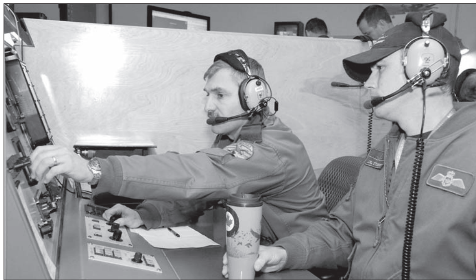
404 Squadron members in the Operational Mission Simulator at 14 Wing Greenwood.

"The series of simulated exercises continues to be the force generation building block to ensure CP-14 Aurora force employment missions are conducted in the most effective and professional manner possible," said 14 Wing Greenwood Commander Colonel Jim Irvine.