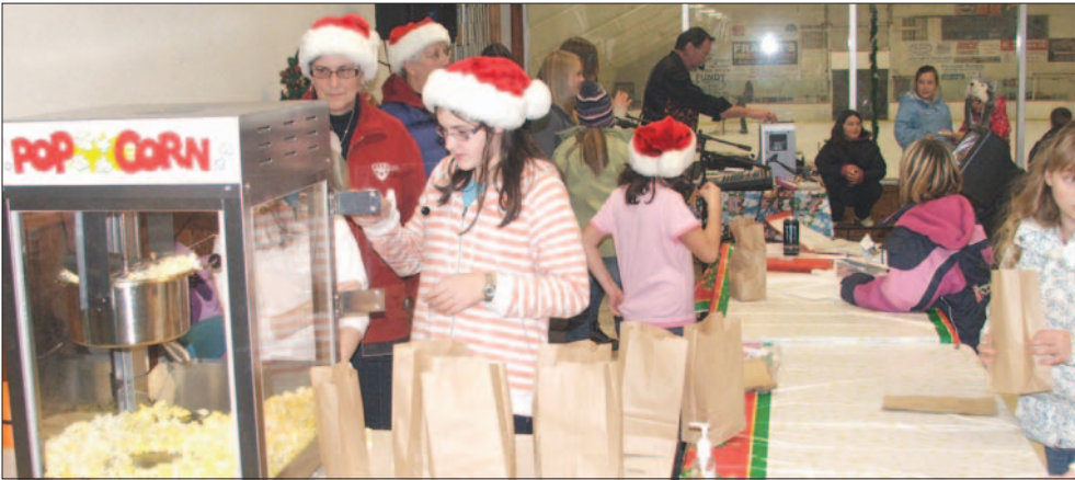
Popcorn was enjoyed by all ages.

Le Centre de ressources pour les familles militaires de Greenwood désire informer la communauté que le Centre et la halte-garderie du CRFMG seront fermés du 23 décembre jusqu'au 2 janvier inclusivement. En cas d'urgence, communiquer avec les Opérations de l'Escadron au 765-1494, poste 5457.