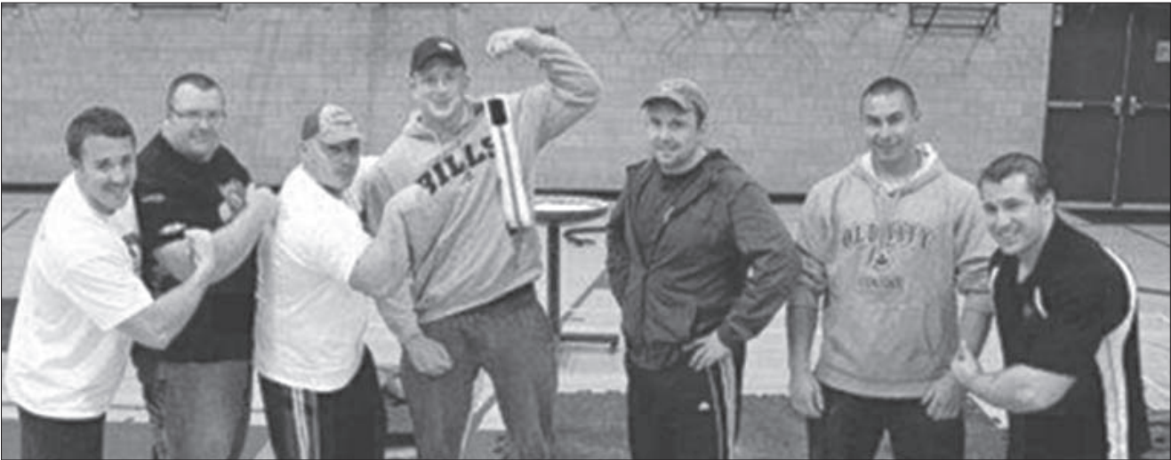
The 14 Wing power lifting contingent at the Atlantic invitational in Gagetown November 22. Image submitted