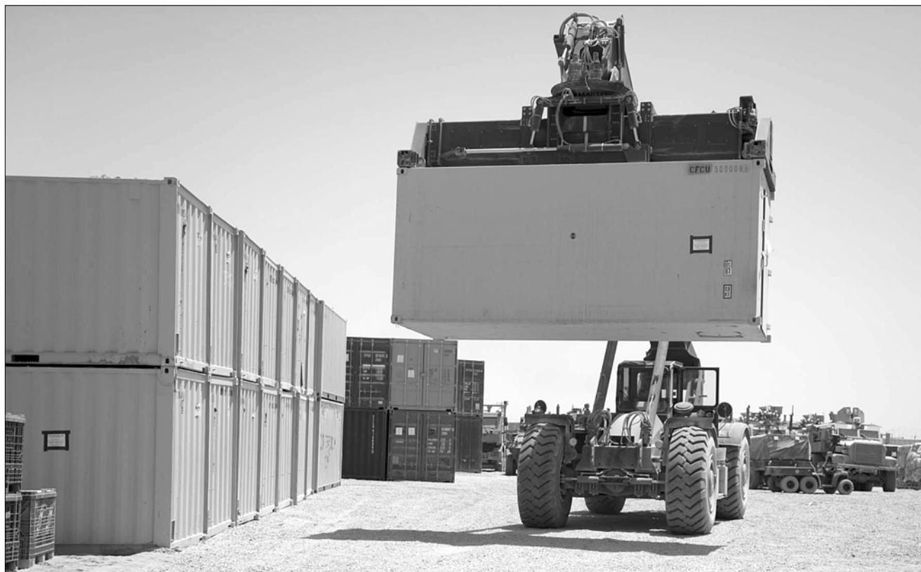
The first group of shipping containers loaded with Op ATHENA materiel to return to Canada in July.

"From the beginning, it was evident that the Mission Transition Task Force would have to be structured differently. It