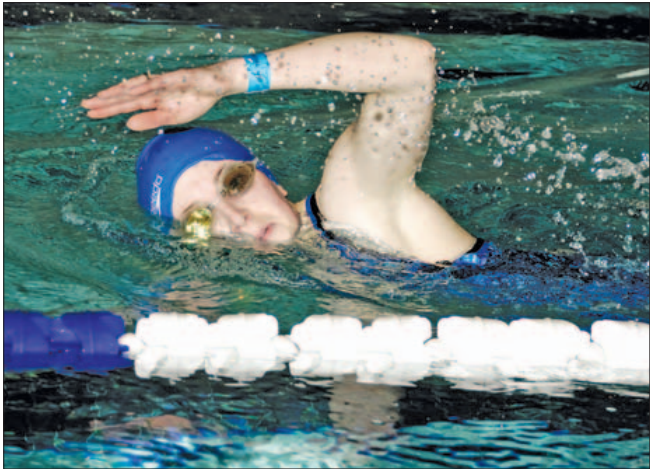
Civilian and military swimmers from across the Maritimes compete in a 750 meter swim at the 14 Wing Greenwood Fitness and Sports Centre during the 32 nd Annual ZX 10km Road Race and 5km Fun Run.

The ZX Cycle N' Run Club would like to thank our local sponsors who provided prizes, all 14 Wing Greenwood organizations who provided support, RCMP for traffic control, volunteers who made this event possible and the runners and swimmers who made this event a success!