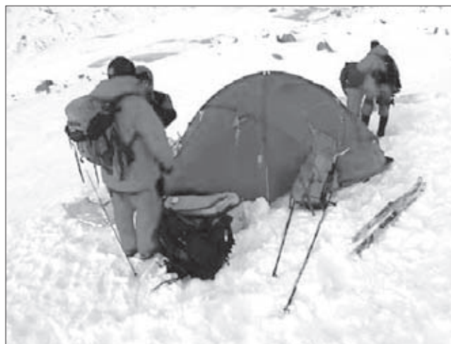
The stranded hikers campsite on Baffin Island.