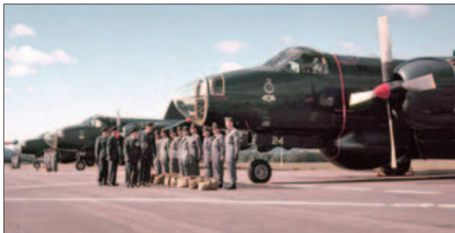
404 Squadron crews are inspected in front of their Neptune P2V aircraft at CFB Greenwood.

The pride in belonging to ‘The Herd’ will be shared in conversation with veterans, and with those who served during the Cold War and on many deployments flying the Lancaster,