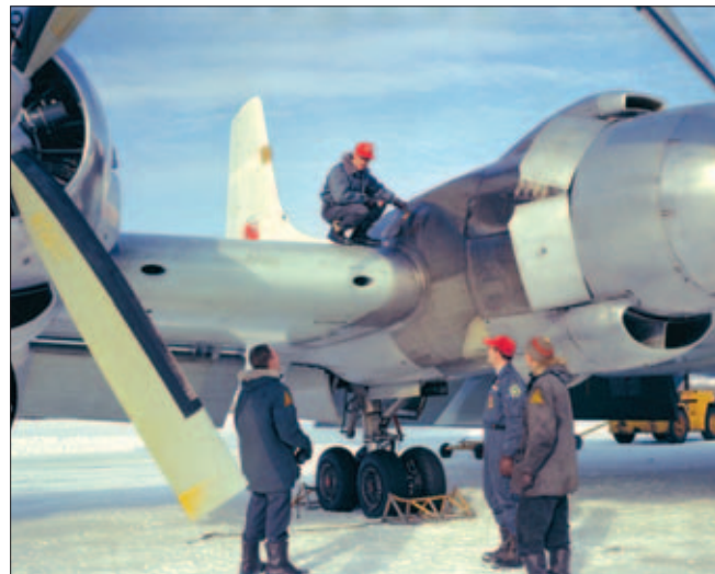
404 Flight Engineer on the Wing of a Canadair Argus prepares the ‘Hundred Eyed Monster’ for flight while chatting with ground crew and a pilot prior to a mission in 1961.