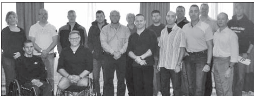
Injured Soldier Network Peer Support Volunteers – 7 Oct 2010. (Image submitted) Pairs Aidants Bénévoles du Réseau des Soldats Blessés – 7 oct 2010.

All peer supporters are volunteers who must be trained in order to carry out their duties with the ISN. They encourage peer clients to live life without limitations, promote empowerment and provide an example of hope, and potential for achievements after a traumatic injury.