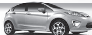
SEL 5 Door Model Shown 2011 FIESTA S with No-Extra Charge Winter Safety Package

Own for only $103 @ 6.99%* APR Bi-weekly financed over 72 months with $0 down payment. Offer excludes taxes and freight.