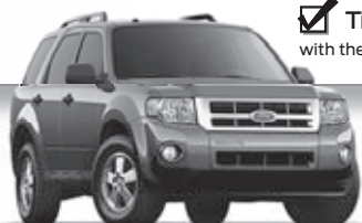
2011 ESCAPE XLT I4 with No-Extra Charge Winter Safety Package

Own for only $185 @ 3.99%* APR Bi-weekly financed over 72 months with $0 down payment. Offer excludes taxes and freight.