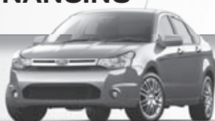
2011 FOCUS SE with No-Extra Charge Winter Safety Package

Own for only $139 @ 0%* APR Bi-weekly financed over 60 months with $0 down payment. Offer excludes taxes and freight.