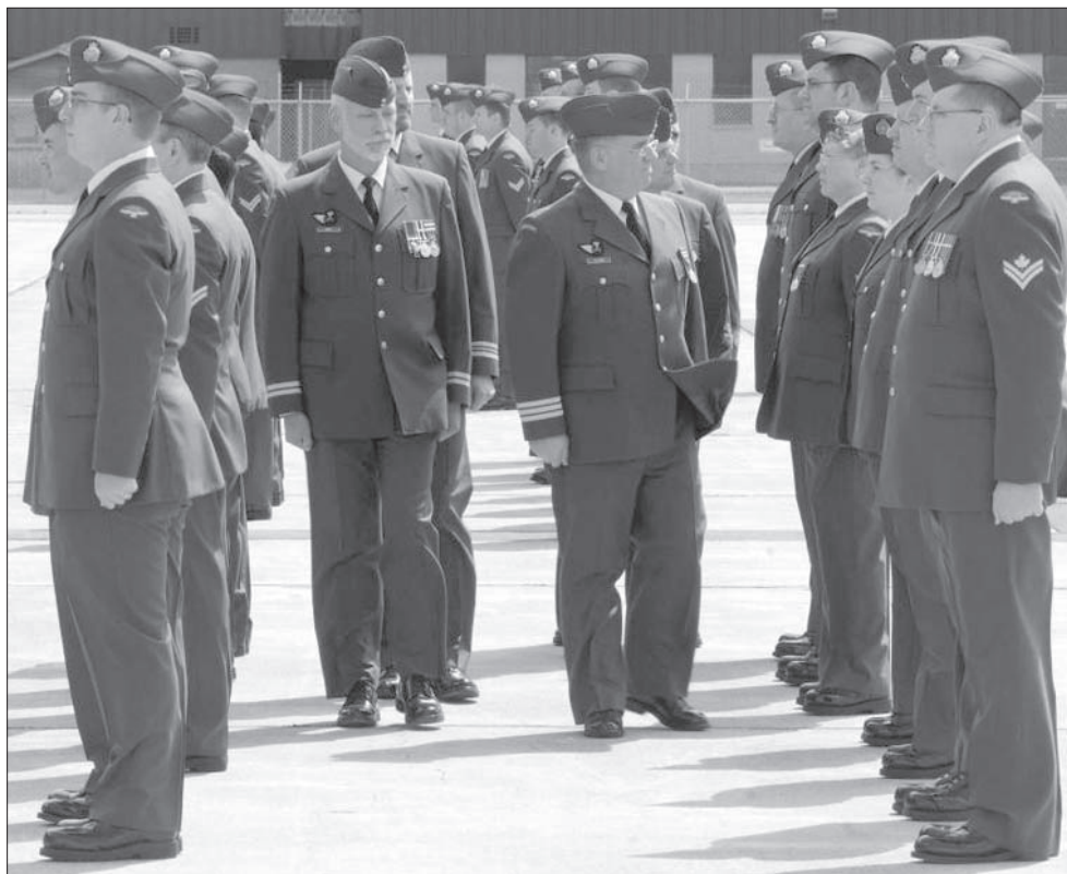
Various accolades were presented.