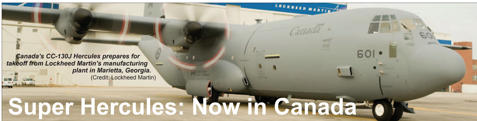
Canada's CC-130J Hercules prepares for takeoff from Lockheed Martin's manufacturing plant in Marietta, Georgia.