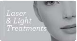
Laser & Light Treatments