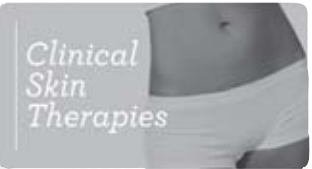
Clinical Skin Therapies

Eterno would like to invite you to experience the Annapolis Valley's only luxury day spa. Centrally located in downtown Kentville, Eterno offers its clients innovative and unique services and products in a location that is meant to be as soothing to the mind as it is to the body.