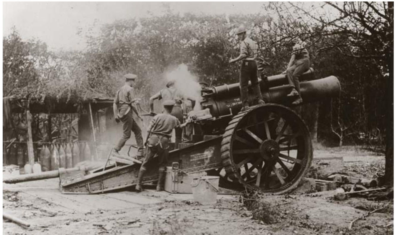
Artillery such as this howitzer fired hundreds of thousands of shells, before and during large battles. Artillery fire inflicted approximately 60 per cent of all wounds during the First World War. Library and Archives Canada, pa-000743

With the beginning of the centennial of the First World War in 2014, Canada will participate in the Bastille Day Military Parade in France. In 2015, the 100th anniversary of the Battle of Gallipoli will be marked with commemorative ceremonies in Turkey. A highlight in 2016 will be the 100th anniversary of the battles of the Somme and Beaumont-Hamel. Centen-