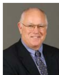
GREG KERR MP - West Nova Député - Nova-Ouest

Stephen McNeil, Premier of Nova Scotia MLA ANNAPOLIS Constituency Office 142 Commercial Street, P.O. Box 1420, Middleton, NS B0S 1P0 Telephone: 902-825-2093 Fax: 902-825-6306 Toll-free: 1-800-317-8533 E-mail: stephenmcneil@ns.aliantzinc.ca www.stephenmcneil.com