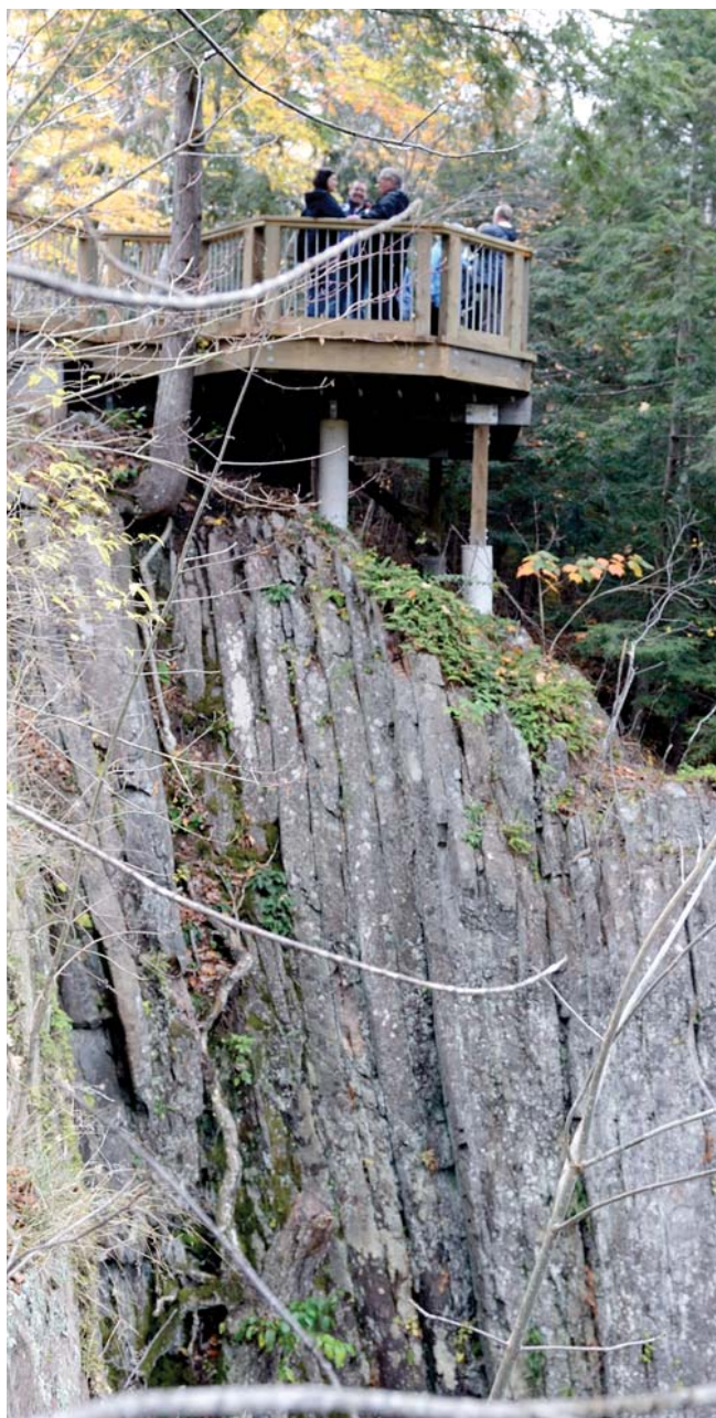
14 Wing Greenwood construction crews spent 1,000 hours building this cantilevered overlook over the plinth of the old Rocknotch McMaster Mill.